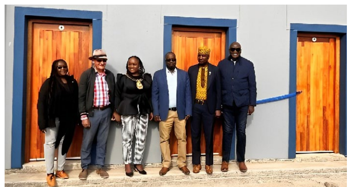
Swakopmund: Inauguration of sanitation centre

On 3 May 2023, Swakopmund municipality handed over six sanitation centres to the residents of Democratic Resettlement Community (DRC), the largest informal settlement in Swakopmund. These sanitation centres were based on the UNICEF-funded sanitation centre in Waag-Daar, Swakopmund, which was established by DWN in February 2022. Sanitation centres are part of the CLTS approach, providing an example of a cost-effective and safe toilet. It’s encouraging to observe that local authorities are embracing the CLTS methodology to eliminate open defecation in Namibia.