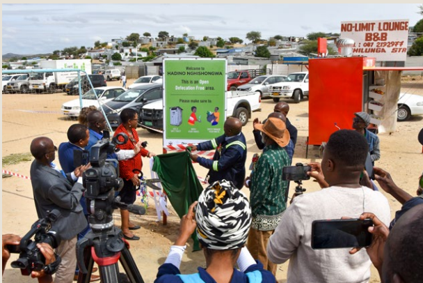
UNICEF and MAWLR representatives reveal the ODF panel