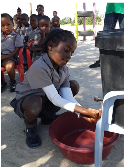
Onawa, Oshakati: DWN volunteers teaching children how and when to wash hands.

In the first half of 2023, DWN has reached over two hundred young children in and around Onawa through engaging visits to early childhood development (ECD) centres. Volunteers have already noted how engaging the children has improved the sanitation conditions in Onawa.