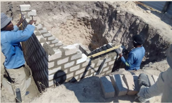
Construction of OTC toilets in progress AUG 2023

DWN has been working on the first Namibian urban sanitation documentary. The 30-minute film showcases the urban CLTS programme in the country. It also raises awareness about the sanitation crisis in informal settlements, and serves as a call to action. In the second half of 2023, the documentary will be distributed and screened in various informal settlements, on national television, and as part of panel discussions with sanitation partners and government representatives.