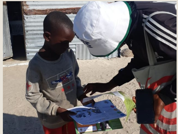
Sharing sanitation information with children

CLTS depends on collaboration. The programme works closely with local authorities, the Ministry of Health and Social Services and the Ministry of Agriculture, Water and Land Reform. DWN is actively engaged with the national Water supply and Sanitation (WATSAN) Forum, and participates in the national clean-up campaign.