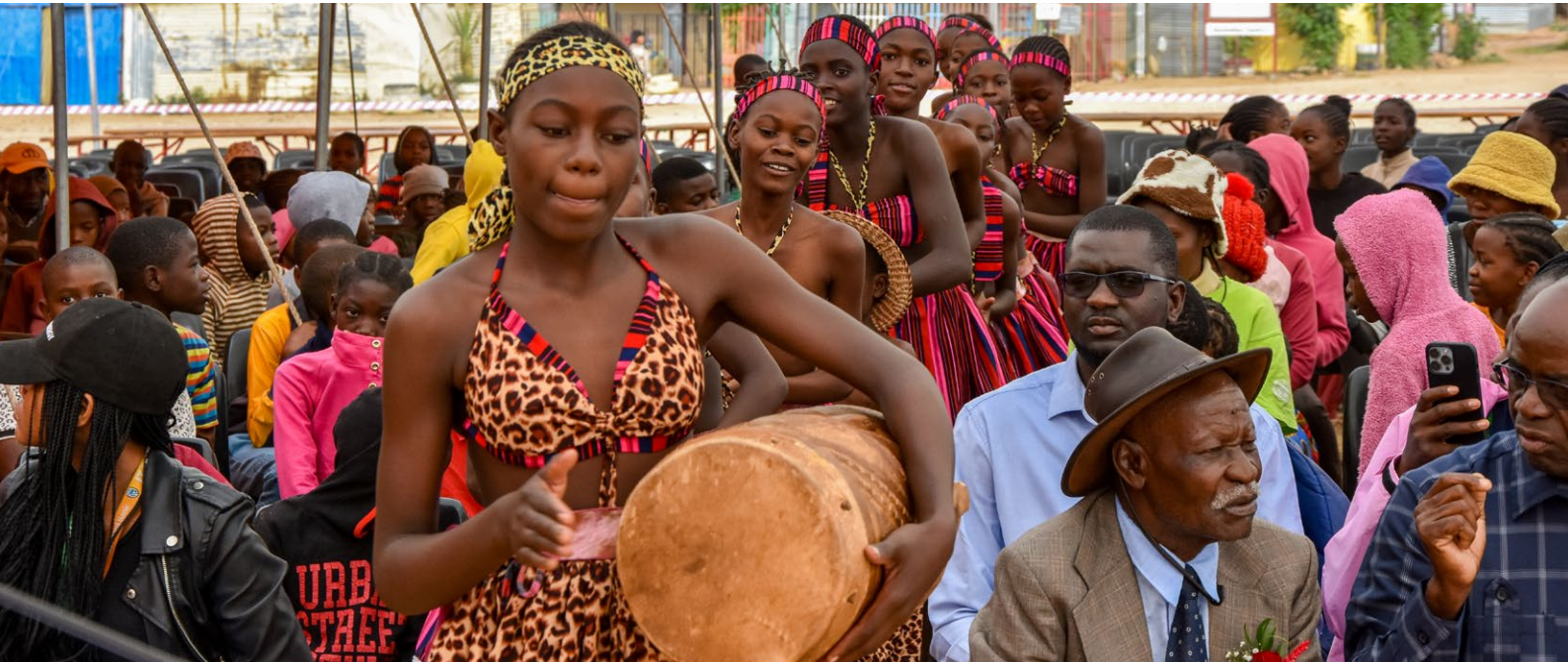
A local dancing troupe celebrates the open defecation free status in Windhoek's Hadino Nghishongwa block.