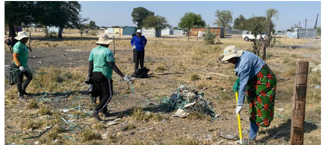
Onawa community members participate in a clean-up campaign