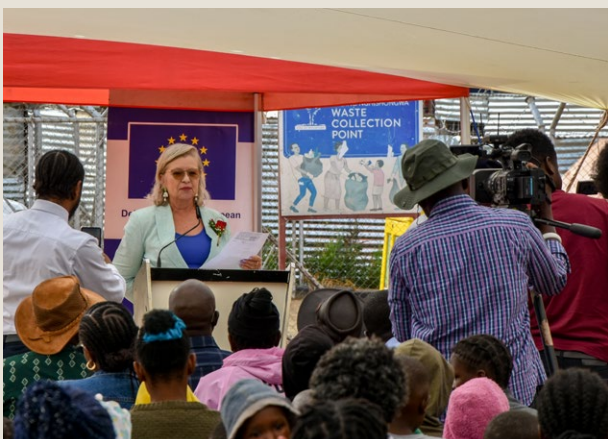
EU Ambassador delivers her address